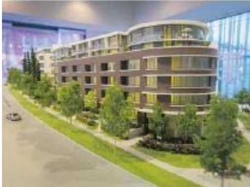
The exterior display model of Empire at QE Park demonstrates the incorporation of green space into the design.