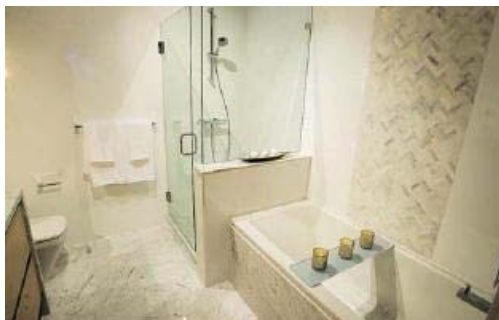
Left: The two bedrooms in the show suite are separated by the main living area, allowing for privacy. Shown here is the master. Right: The ensuite is outfitted with marble mosaic tiles above the tub, a frameless glass shower and a double vanity.